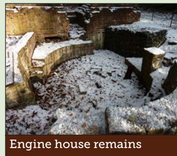
Engine house remains

4 This engine was used to pump the water out of the mines once located here.