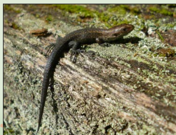
Lizard in heathland

3 A heathland, on your left, hosts a variety of wildlife and a panel shows the history and geology of this landscape.